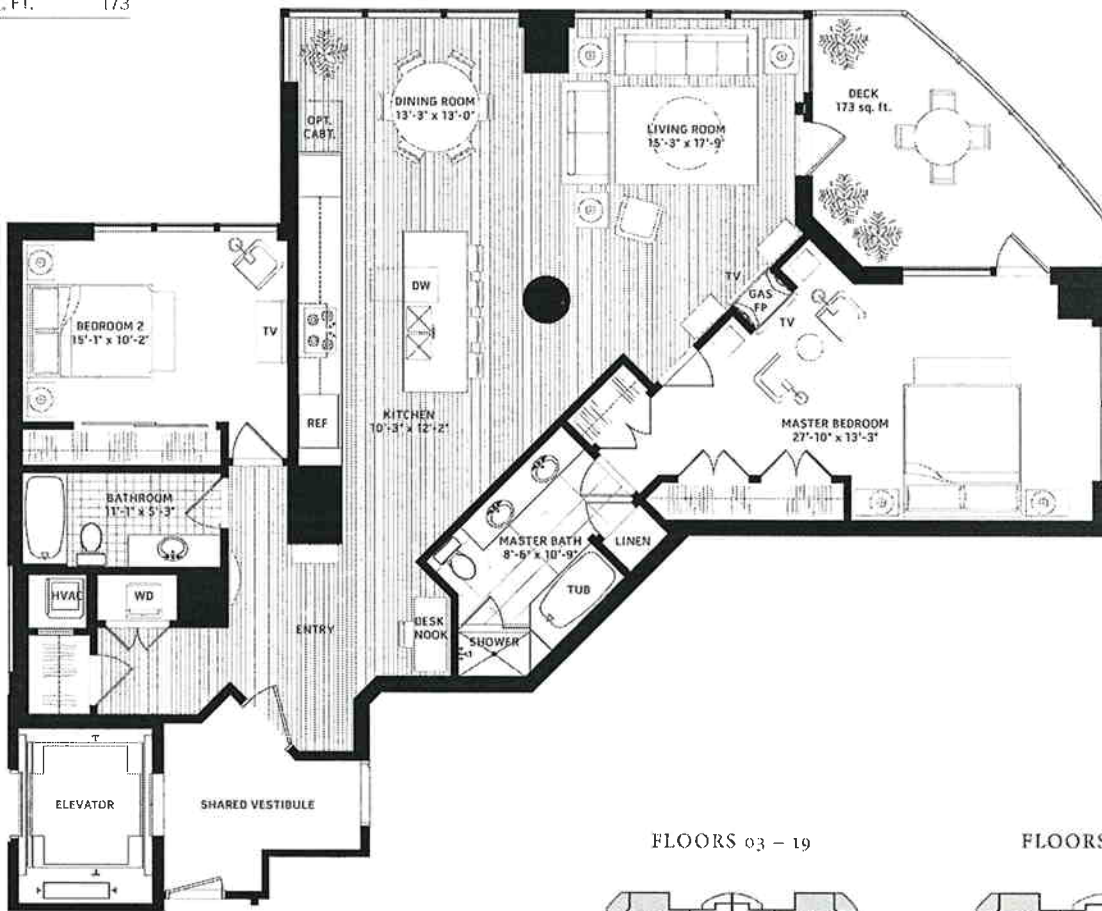
FLOORS 03 – 19