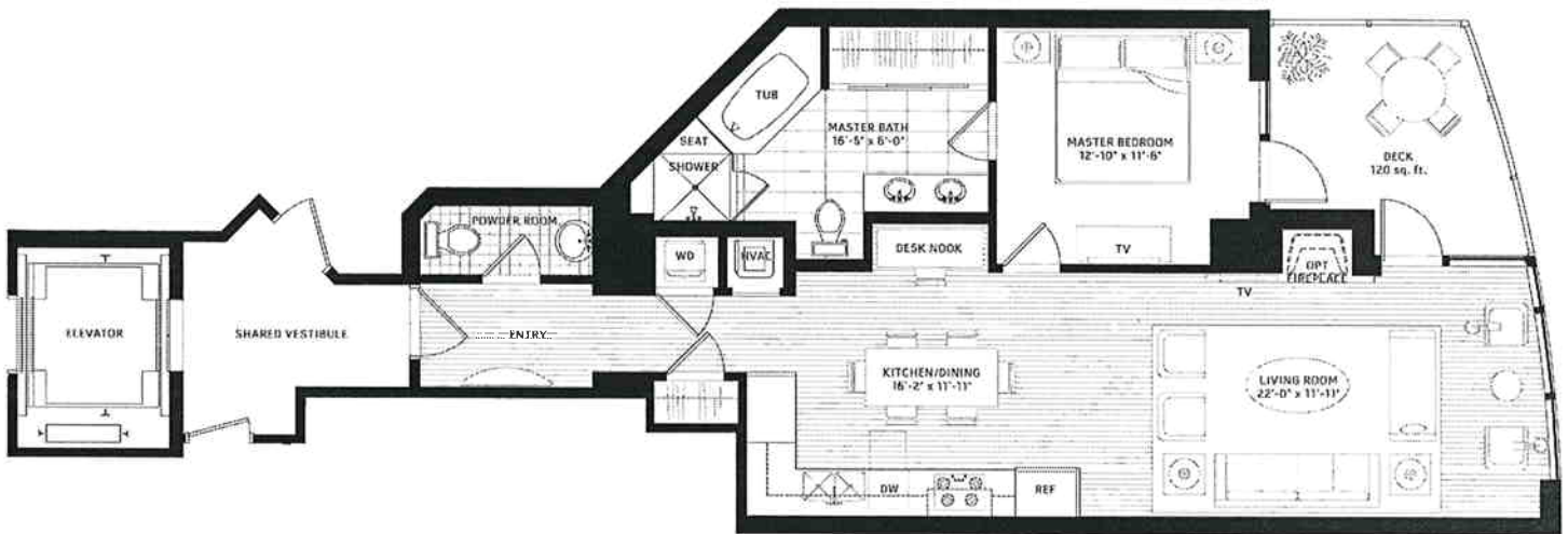
FLOORS 03 – 19